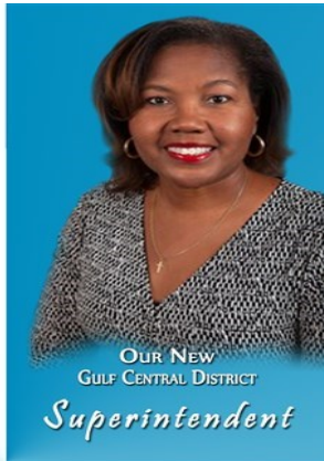
OUR NEW GULF CENTRAL DISTRICT Superintendent